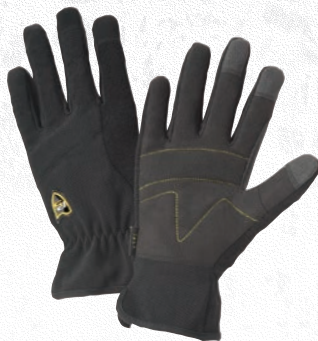
86110 The Task® M-2XL