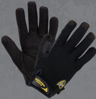
86150 The Job 1® S-2XL

Form fitting spandex back and pre-curve design enhances comfort and delivers unrestricted movement and dexterity.