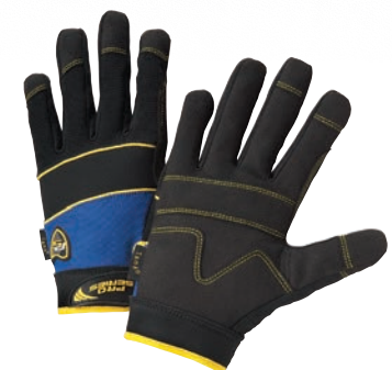
86500 The Tank® M-2XL