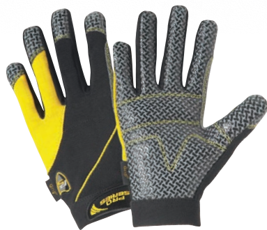
86650 The Grip M-2XL