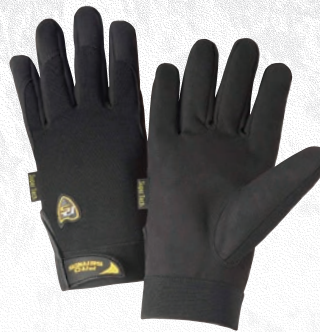
86300 The Super Tech® M-2XL